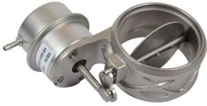
Exhaust Bypass Valve