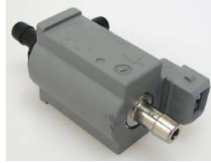
Vacuum Solenoid Valve

The vacuum solenoid valve controls the vacuum delivered to the bypass valves. There is a vacuum line from the engine to the solenoid valve and a vacuum line from the solenoid valve to the bypass valve. The solenoid itself is an electrically actuated magnetic coil that opens and closes the vacuum valve. With the application of an electric signal, the solenoid valve will either open or close to apply vacuum to the bypass valve or vent the bypass valve to atmosphere.